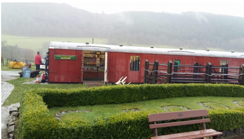
The Carriage/ 5532 Shop situated at Carrog Station on the Llangollen Railway