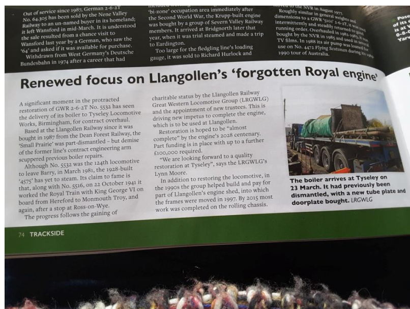
The article that was in Trackside